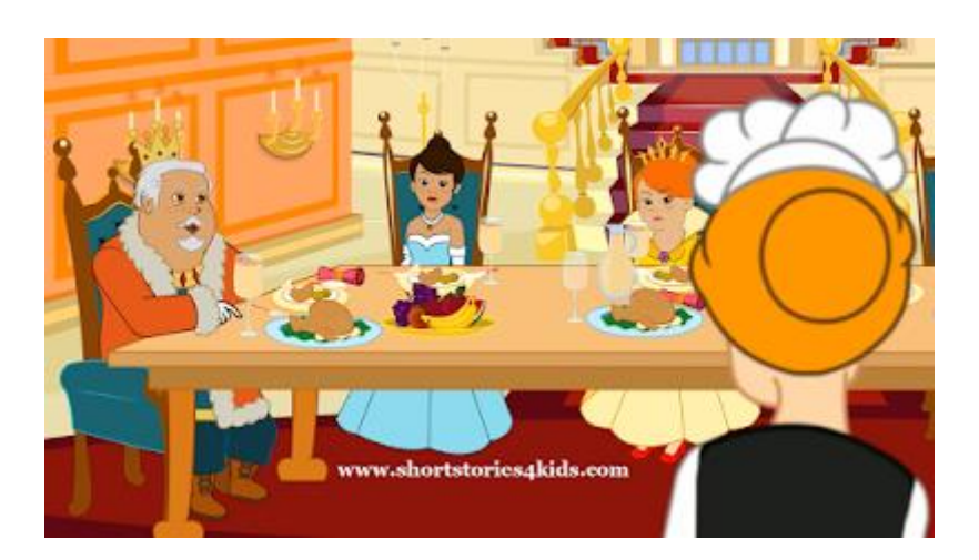
The Frog Prince - Easy Short Stories for Kids

In the Night, the princess sat down at the dinner table with The King and The Queen. When they were about to eat, the maid told them that a frog had arrived and told them that he was invited by the princess and asked permission to come in. The princess told everything that happened to the King. The king said that she should keep her promise and ordered maid to welcome the frog inside.