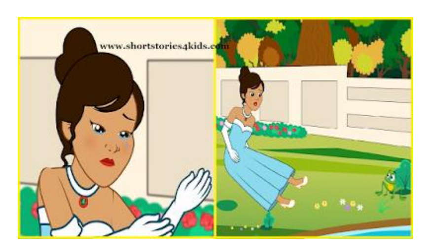
The Frog Prince - Short Stories for kids with pictures

The princess sat next to the pond and started to cry. Suddenly she heard the voice "Ribbit! My beautiful princess why are you crying. Ribbit!". She looked around and saw a frog. The princess told the frog about the ball.